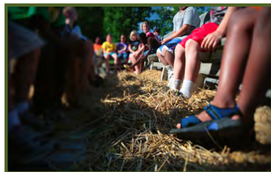
Hay Ride Saturday Night!