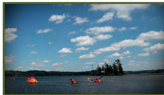
Lakeville Lake in Leonard, Mi