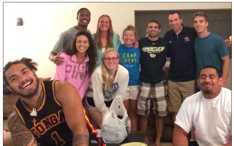
Some of the students who have been attending the leadership study this summer