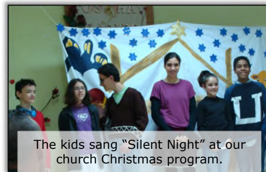
The kids sang "Silent Night" at our church Christmas program.