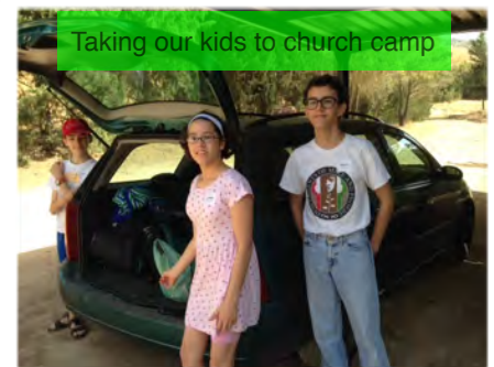
Taking our kids to church camp

activities, and they said that the teaching was also very good. Next week the kids and I will be joining Allen in Ceuta for a little while.