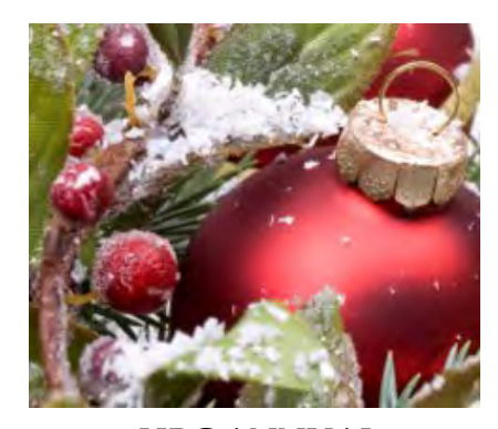
HPC ANNUAL Fenton Ambassadors Show Choir Concert

REFLECTION FROM YOUR PASTOR GRIEF SUPPORT GROUP CHRISTMAS CONCERT HPC HAPPENINGS!