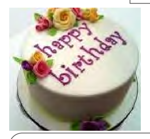
Have a wonderful birthday and may God bless you now and always!